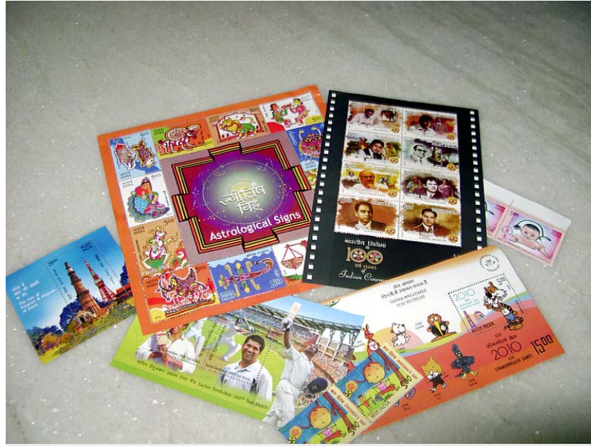
A collection of postage stamps in attractive packs.

The exhibition consisted of a display of about a 100