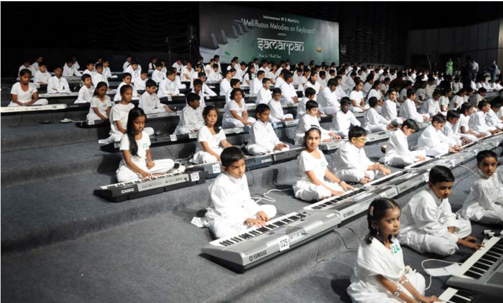
For the records. 229 children playing the keyboard at Samarpan, an event held at Chennai Trade Centre's Convention Hall on Jan. 16, 2014.

Titled Samarpan, music for World Peace, the concert had songs like 'Vande Mataram', 'Vaishnava Jan to' and the Oscar winning 'Jai Ho'.