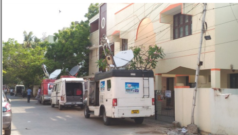
A View Outside TTV Dinakaran's house

It was an unusual scene at an otherwise calm locality in Adyar, when a number of television broadcasting vans were parked one behind the other.