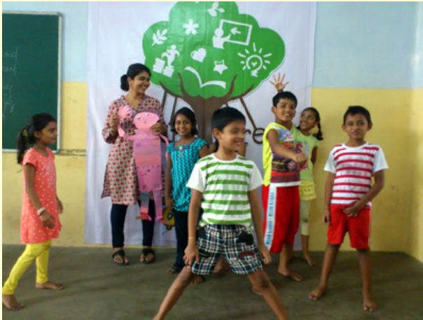
Summer camp at Fun Tree, Mylapore