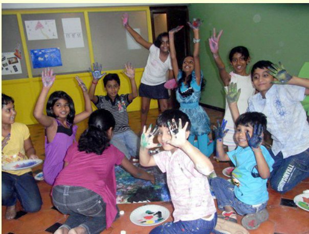
Expressive art at Art n Soul, Anna Nagar