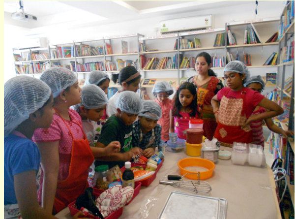
Learning to bake at Hippocampus, Adyar