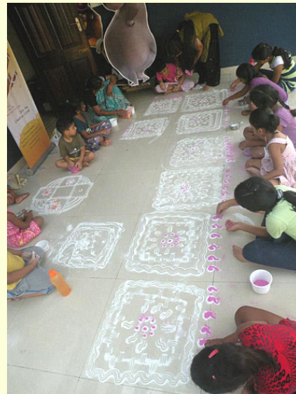
Drawing beautiful kolams at Creative Ladder, T.Nagar