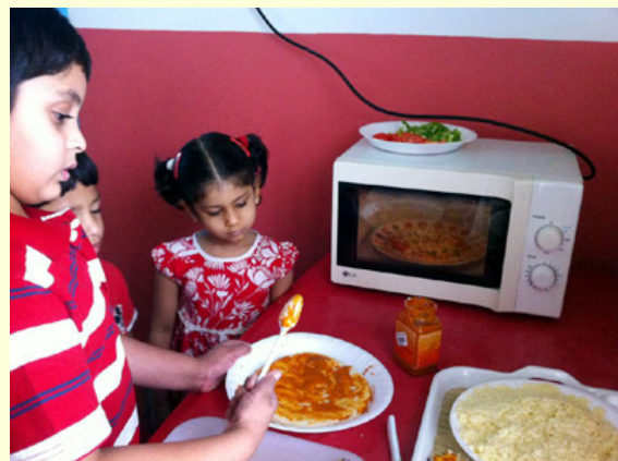
Cooking without fire at Hansel & Gretel Kids, T.Nagar