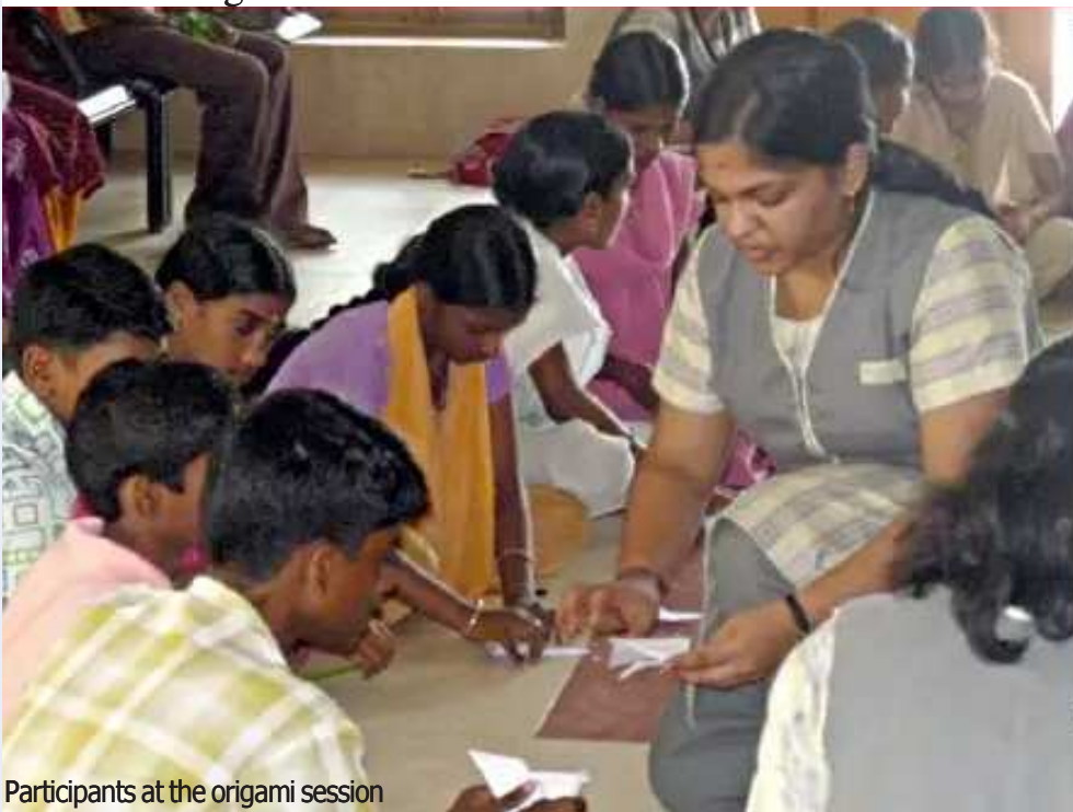
Participants at the origami session

The student volunteers, who enjoyed the unique experience, now look forward to spending more time with their new found friends during the next session.