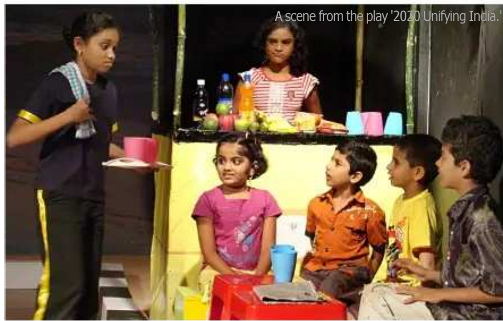
A scene from the play '2020 Unifying India.'