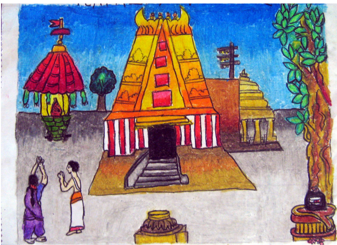
By R. Madhumitha, PSBB, K.K. Nagar

Two select drawing from the juniors category of the Madras week drawing contests are published here.